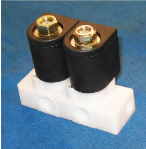
1 IN 2 OUT 2/2 WAY DIRECT ACTING SOLENOID VALVE WITH 1/8" SCREWED FEMALE CONNECTION